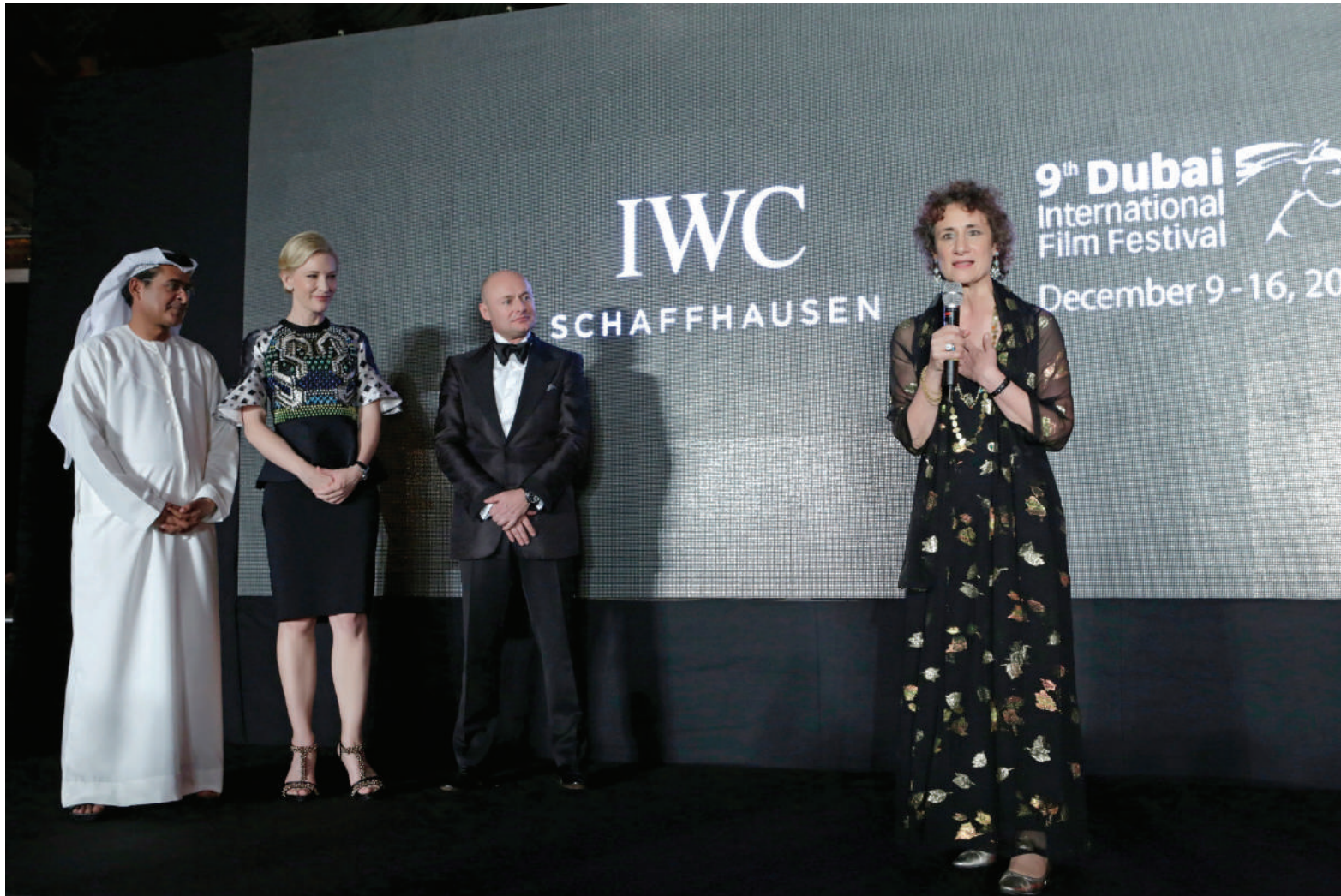
Gala event in Dubai for the IWC Filmmaker Award 2012