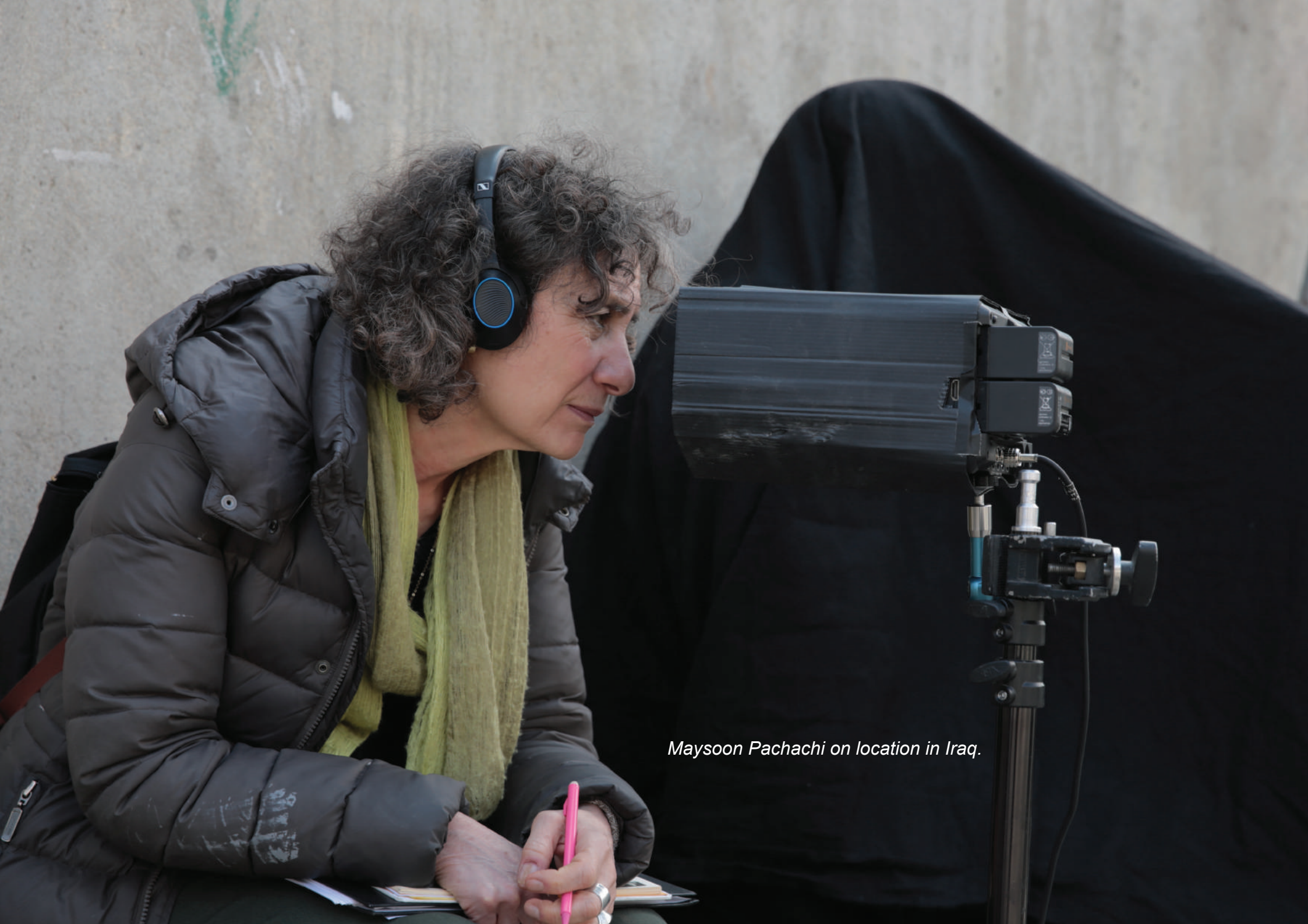
Maysoon Pachachi on location in Iraq.